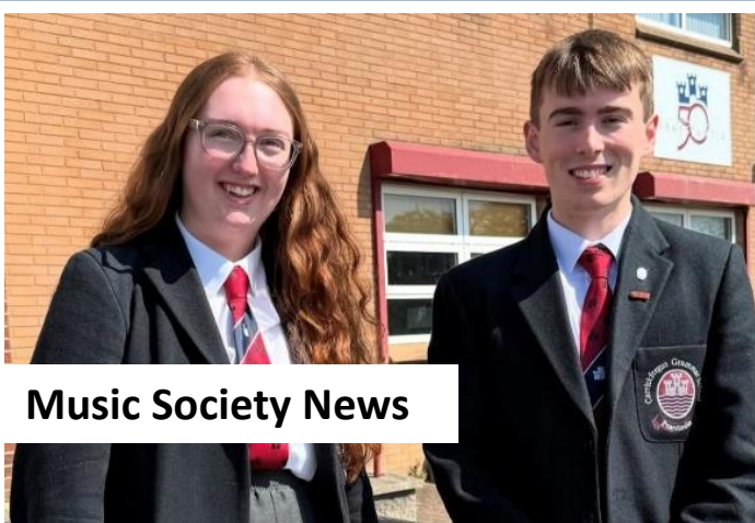
Music Society News

Introducing our new Music Society Leadership Team who will guide the Organising Committee next season.