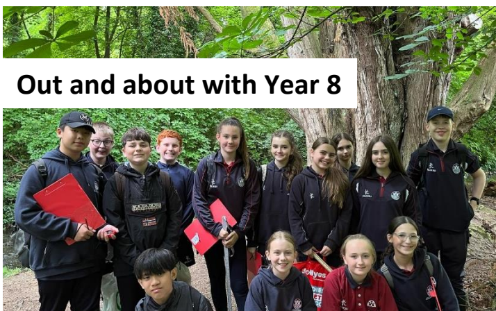
Out and about with Year 8

What a glorious sunny day for our annual Sports Day at Carrickfergus Grammar School! ☀️ The turnout was fantastic, and it was brilliant to see such enthusiasm and effort from all our students across every event. 🙌👏 We're incredibly proud of every single participant — your determination, sportsmanship, and team spirit truly made the day special. 🙌 A special thank you to our amazing spectators who cheered from the sidelines all day, creating such a positive and encouraging atmosphere! #CGSSportsDay #CGSCommunity #ProudToBeCGS