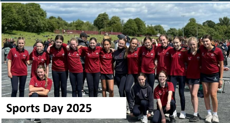
Sports Day 2025