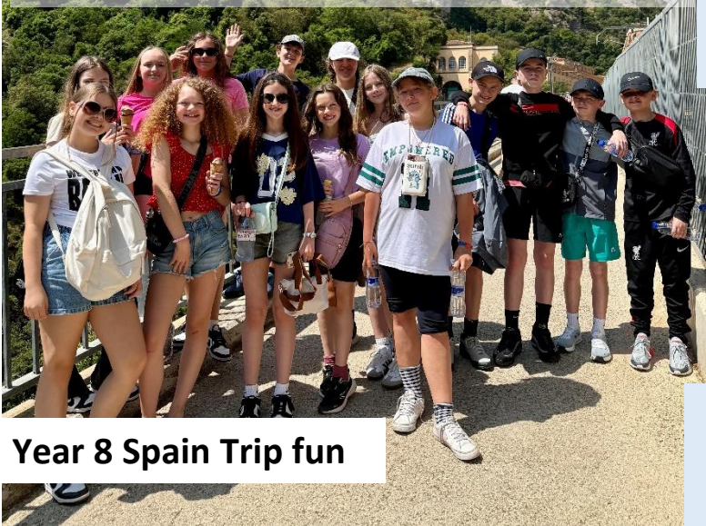
Year 8 Spain Trip fun